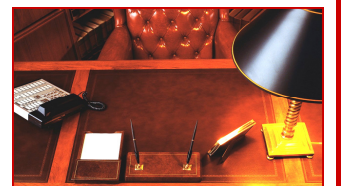
Richard L. Barclay, Minister

These are the days of quick trips, disposable diapers, throw away morality, one night stands, overweight bodies, and pills that do everything from cheer, to quiet, to kill. Where are we heading?