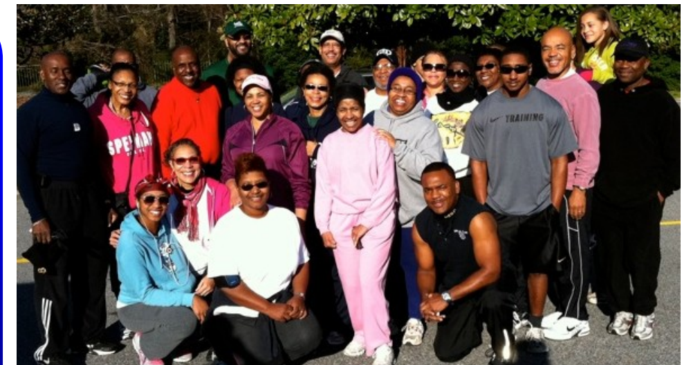
Some of the 40 Hillcrest members who recently took a fitness trek around Stone Mountain pose for a photo.

The "Ultimate Construction Crew" Feted page 7