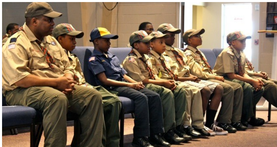
Members of the Hillcrest Cub Scouts pack and their cub master listen attentively to the speakers for the event.

We're rolling out the red carpet for our new members. Please welcome them.